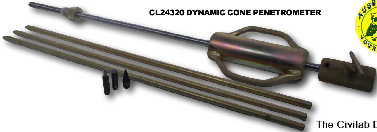
CL24320 DYNAMIC CONE PENETROMETER