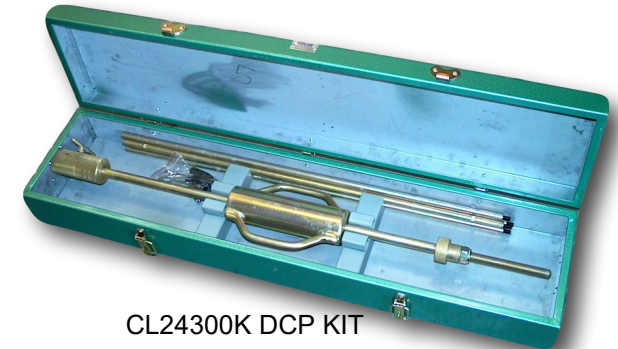
CL24300K DCP KIT

The Civilab DCP is a rugged Australian made piece of equipment with a proven track record. The hammer assembly is a separate unit to which 900mm long graduated rods can be attached. The complete unit includes: 1x Hammer Assembly, 3 x 900mm rods, 1x Conical Tip, 1x Blunt Tip, 1x Flogging Piece.