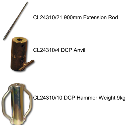
CL24310/21 900mm Extension Rod