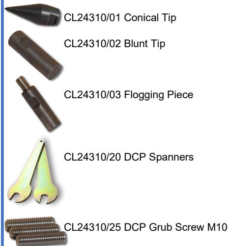
CL24310/01 Conical Tip

The Civilab DCP is a rugged Australian made piece of equipment with a proven track record. The hammer assembly is a separate unit to which 900mm long graduated rods can be attached. The complete unit includes: 1x Hammer Assembly, 3 x 900mm rods, 1x Conical Tip, 1x Blunt Tip, 1x Flogging Piece.